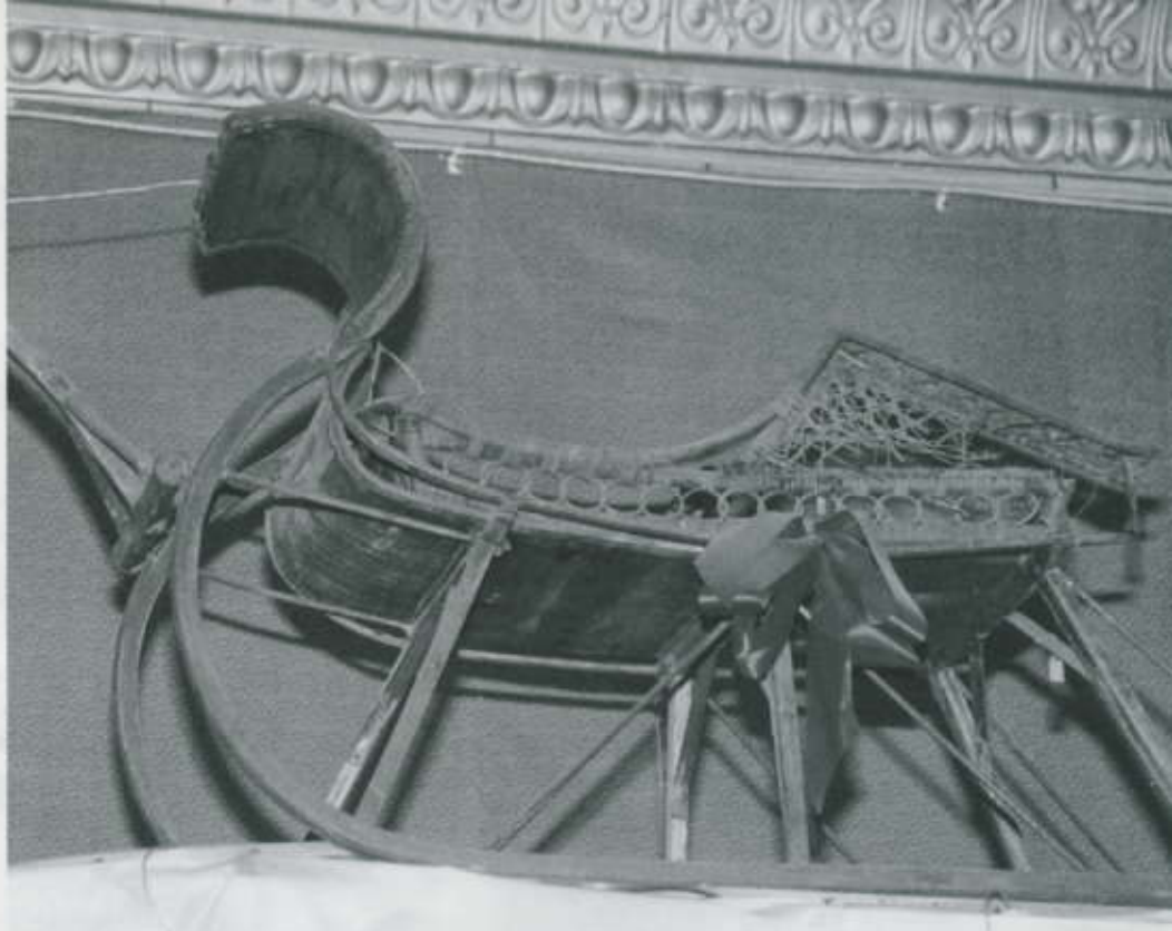
From the antique sled collection.

Visitors to the store will see their purchases rung up on the same mechanical cash register used during Eisenhower's visit. Antiques that have become fixtures